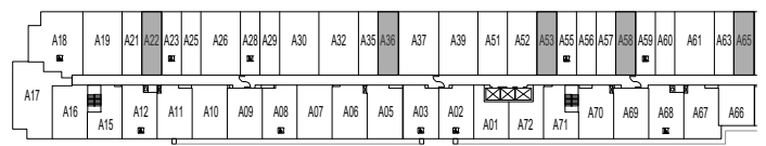
BUILDING A | 3RD FLOOR