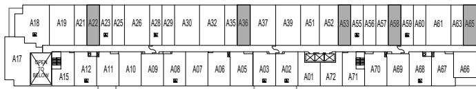
BUILDING A | 2ND FLOOR